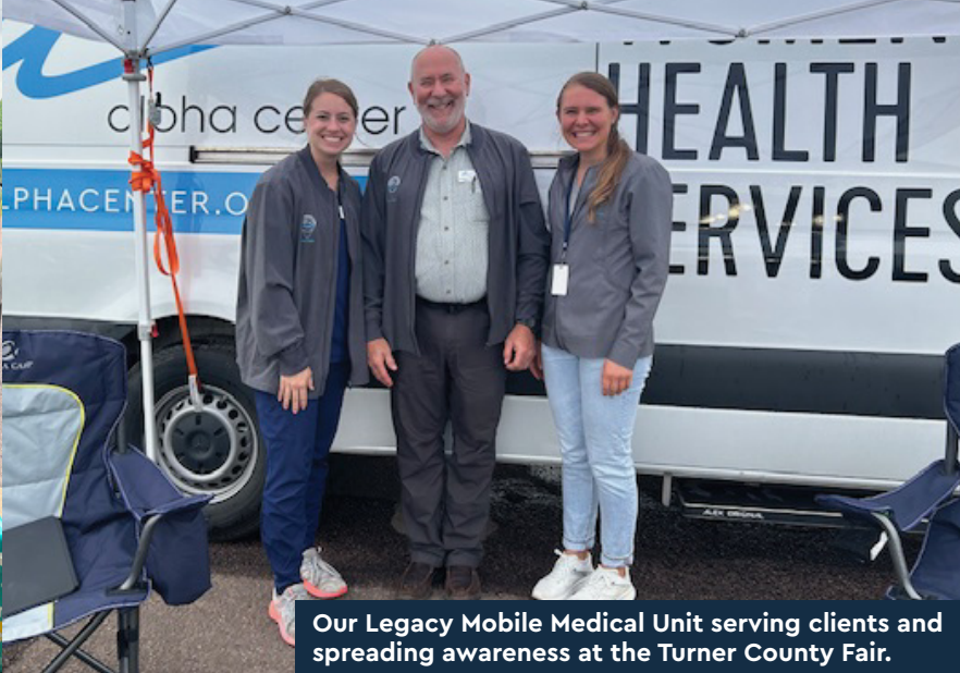
Our Legacy Mobile Medical Unit serving clients and spreading awareness at the Turner County Fair.