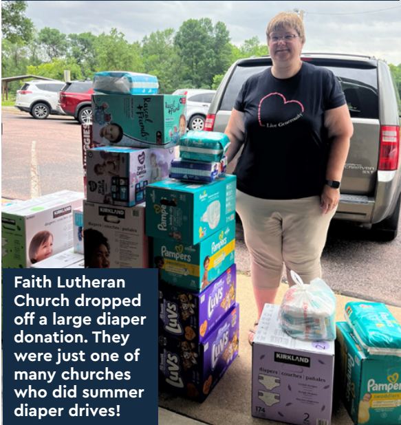
Faith Lutheran Church dropped off a large diaper donation. They were just one of many churches who did summer diaper drives!