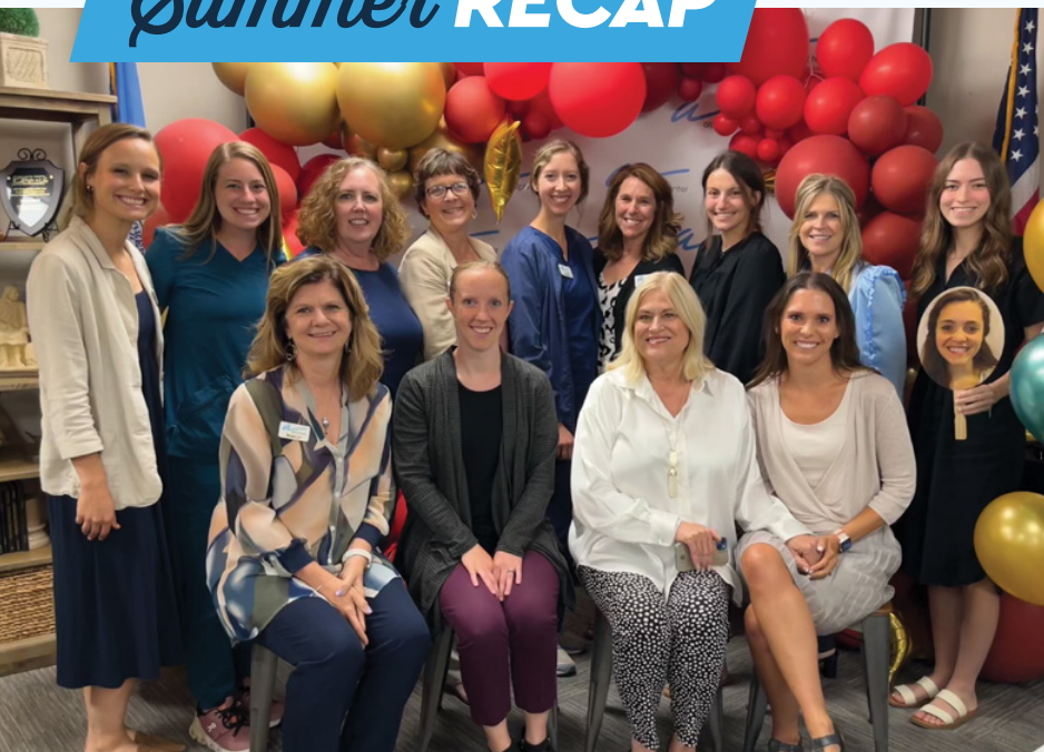
Our staff gathering to celebrate teamwork and the amazing group of volunteers, supporters and prayer partners that help us meet the needs of our clients every day.