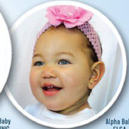
Alpha Baby ELSA