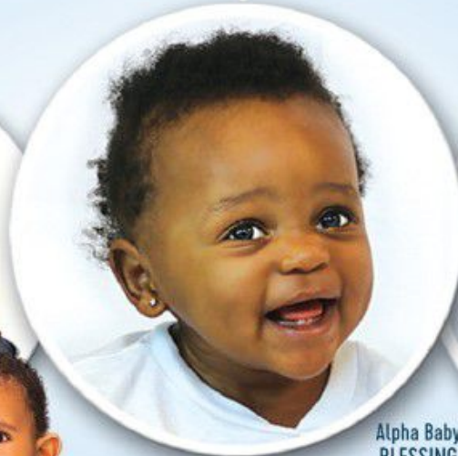
Alpha Baby AMEN