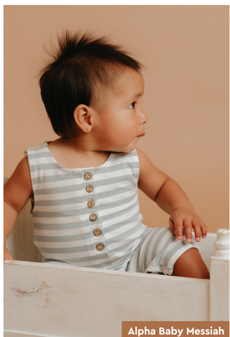
Alpha Baby Messiah