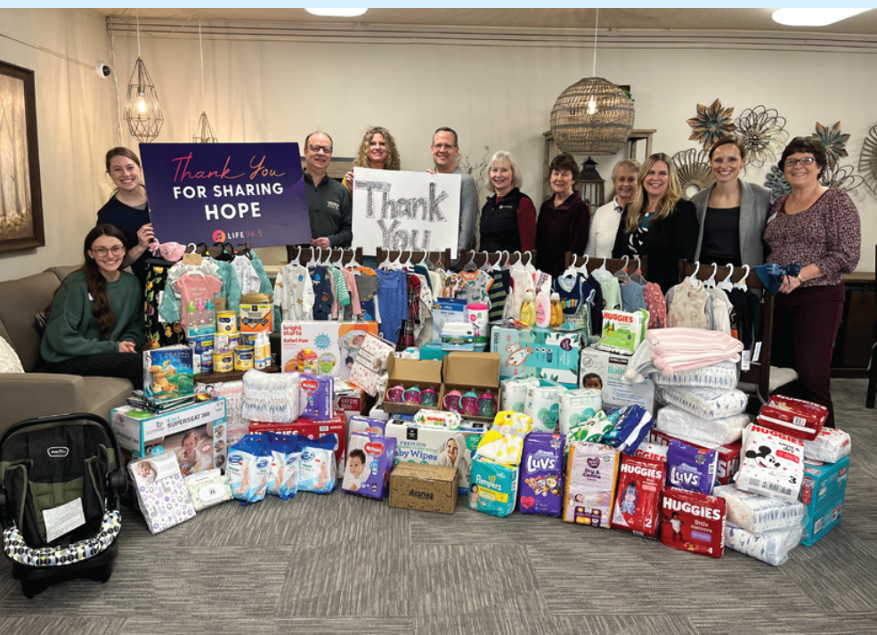
Woodstock Community Church Collection

Sioux Empire's Largest Baby Shower has been impacting the lives of Alpha Center clients for over 20 years. A total of over 2,500 baby items was received as part of this January's Baby Shower! We are grateful for the special partnership with Life 96.5 in promoting the event and Lewis Drug stores for serving as additional drop-off locations. Clients were grateful to be able to earn these items with their Baby Bucks, especially larger baby items they had been waiting for. Thank you to everyone who generously supported the success of this event! You have made a difference in the lives of the families we serve.