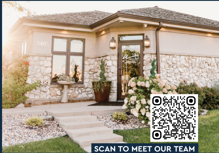
SCAN TO MEET OUR TEAM

Interested in joining our team as staff or volunteer? Opportunities are available! Contact us for an application at 605-361-3500.